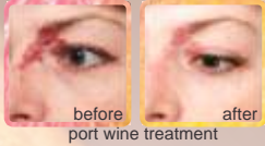
before after port wine treatment