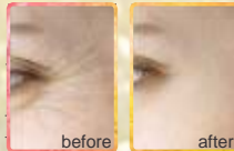
before after facial meso therapy